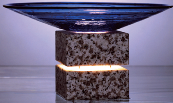
SPRITUAL LIGHT - Aroma Dispenser + Lamp (short)