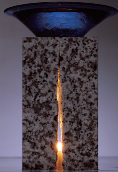
SPRITUAL LIGHT - Aroma Dispenser + Lamp (tall)

Master's Degree in Design & Moving Images. Fine Arts and Music. Born in 1969 in Kanagawa Prefecture. Graduated Tokyo National University of