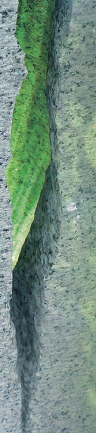
TOKINOHA - Floor Lamp with Kaleidoscopic Illumination

For more information please contact: http://www.strawberryfair.net/