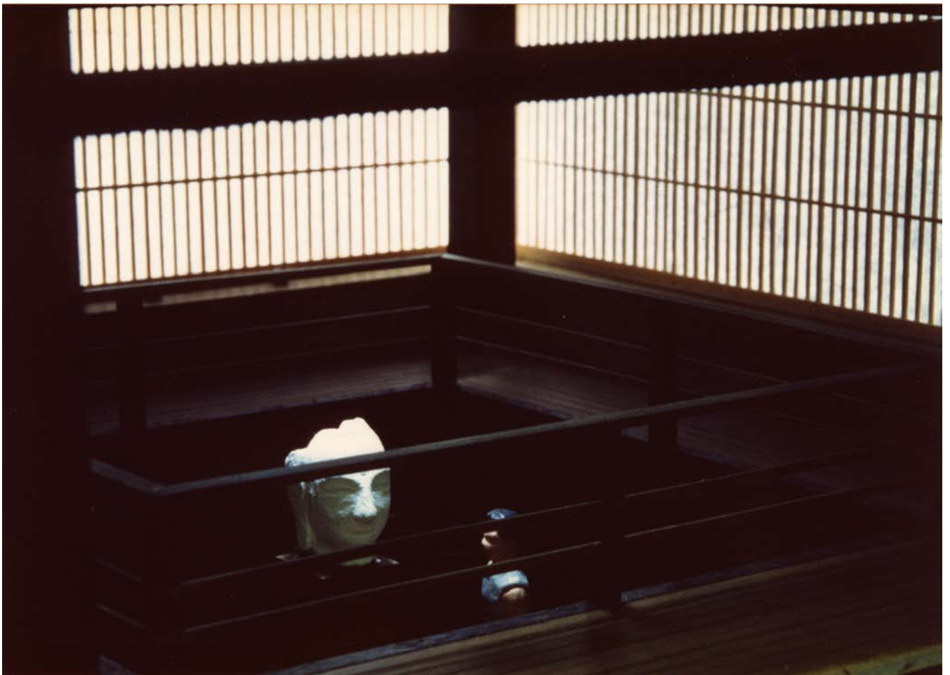
WORK#3: Buddha's Head

Next, descend the corridor to view the Buddha's Head close-up.